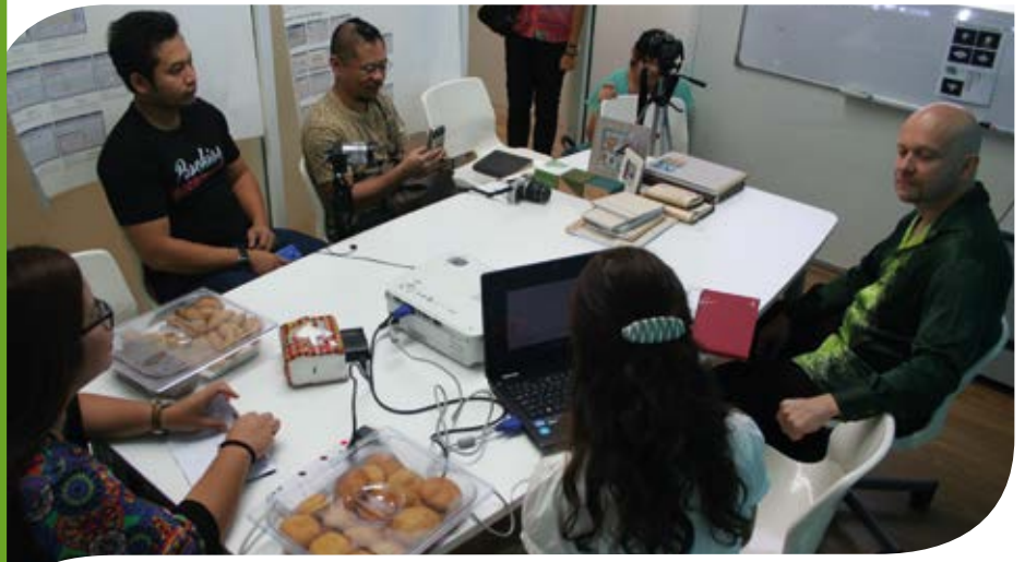
The Greenman recommends our eco printing services to The Star & Astro Awani