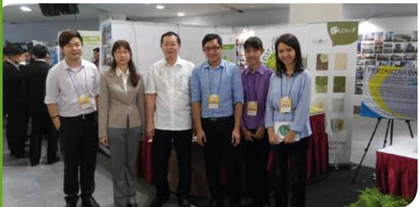
The team with Penang Chief Minister

This year, Penang Green Council continue to organise Penang Green Carnival. The event took place from 13 - 14 June 2015 (Saturday – Sunday) at Avenue Mall. Penang is committed to supporting inspiring organisations & projects that educate and benefits their local communities. As one of the sponsor, we also showcase eco printing & eco products there with a team of four. This is a way to create awareness and shows the world we are part of the global green economy.