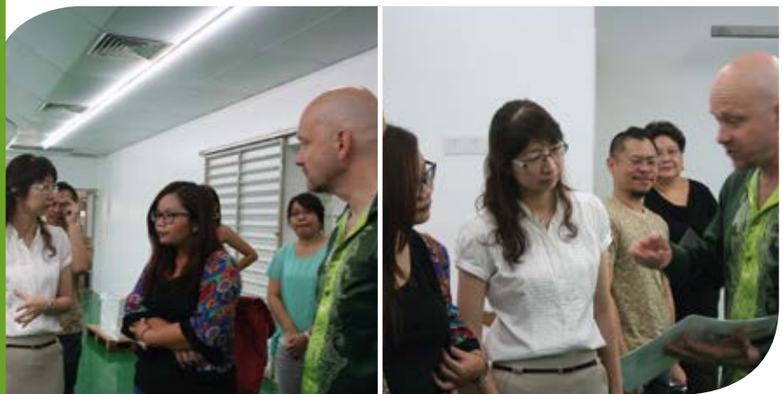
The reporters were briefed on site and witnessed the printing process

The news was published in the The Star newspaper on 13 June 2015 as Malaysia'a first carbon-neutral guide aims to help citizens embrace eco-actions.