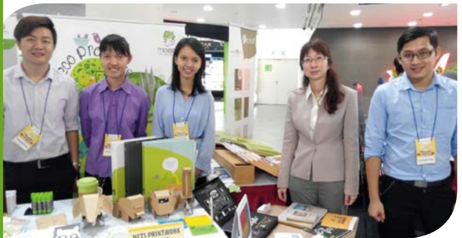
Promoting our services & products at Penang Green Carnival