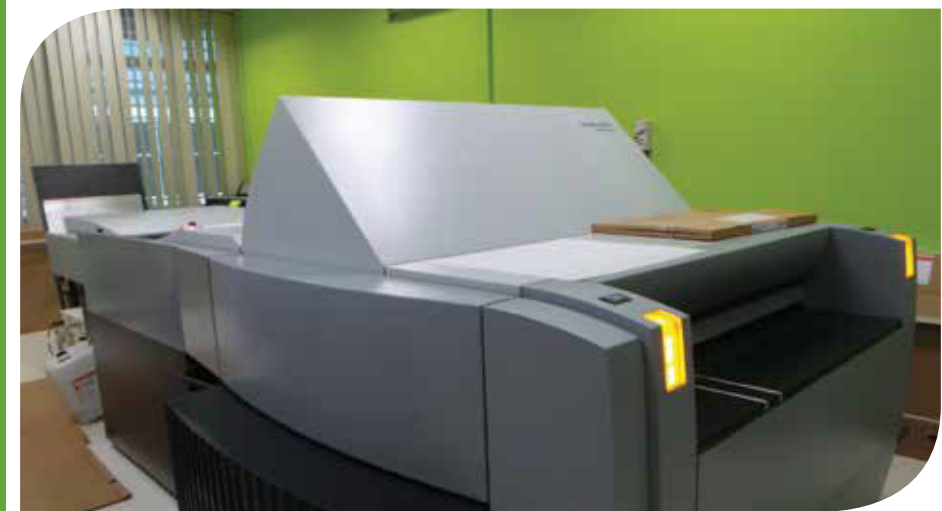
The new CTP machine to cater for A1 size job