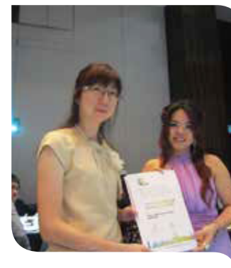
Receiving appreciation certificate at MGBC dinner