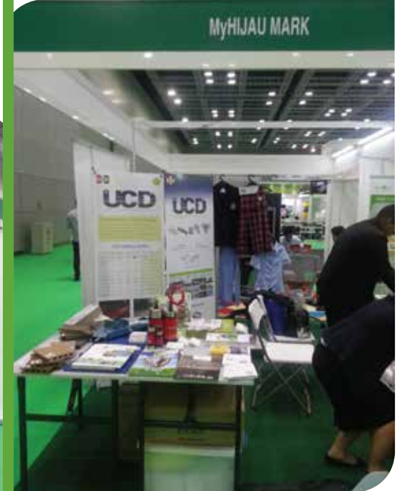
Our booth display.