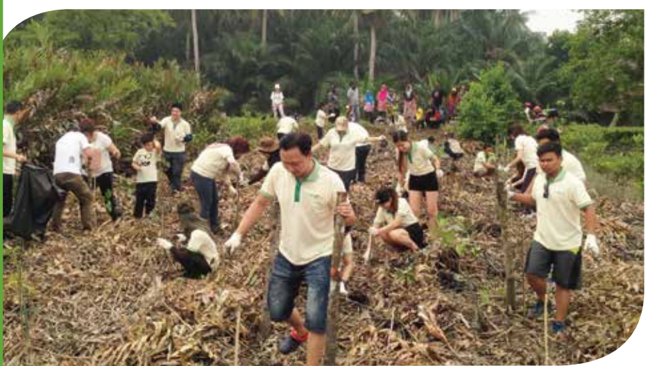
All the tree planters moving into the planting site.