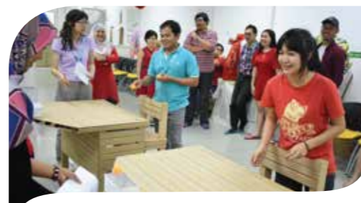
The operators try to throw ping pong ball in the box.