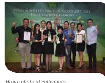
Group photo of colleagues.

Nets Printwork has once again won the SME Award at the Prime Minister's Hibiscus Award (PMHA) 2016/2017. This time, we had also bagged another two awards, i.e. Selangor State Award as well as the Exceptional Achievement Award.