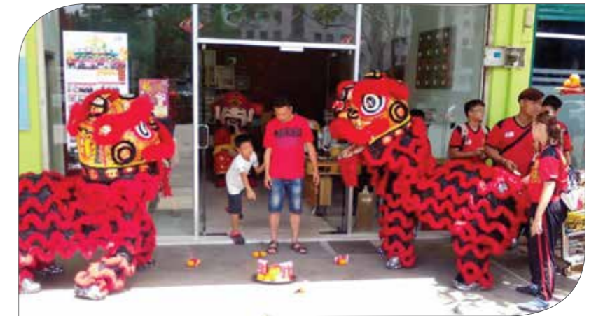
Lion dance in front of Nets Group's reception area.

Lion dance in first day of working day after CNY in front of office to bring good luck and fortune.