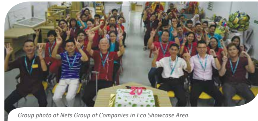
Group photo of Nets Group of Companies in Eco Showcase Area.