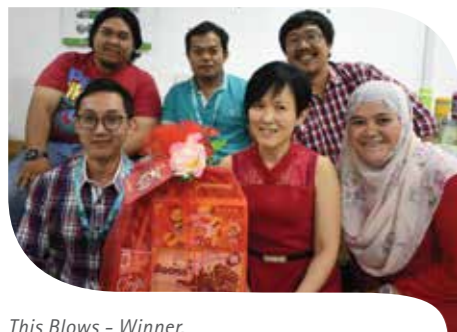
This Blows - Winner.