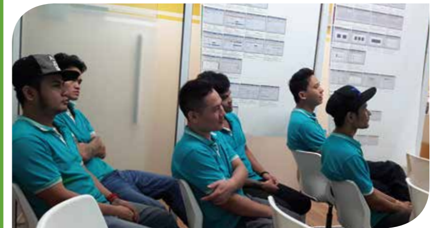
Foreign operators pay attention to training.