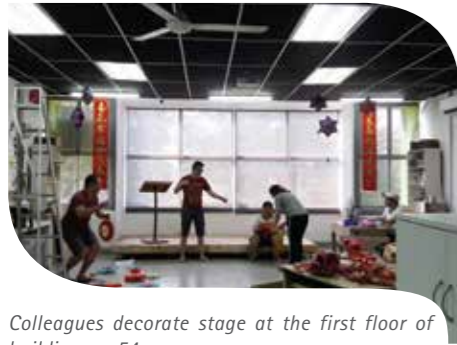
Colleagues decorate stage at the first floor of building no. 54

After we decorated the area on 10 Feb 2018 (Sat), we celebrated 20th Anniversary (1997-2017) during the CNY celebration. For the first time, the company showed their appreciation the senior staff who has worked more than ten (10) years in the organisation. The Long Service Award was made by wood into a book shape.