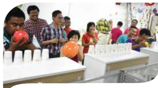
Everyone blowing a balloon to blow down the paper cups.