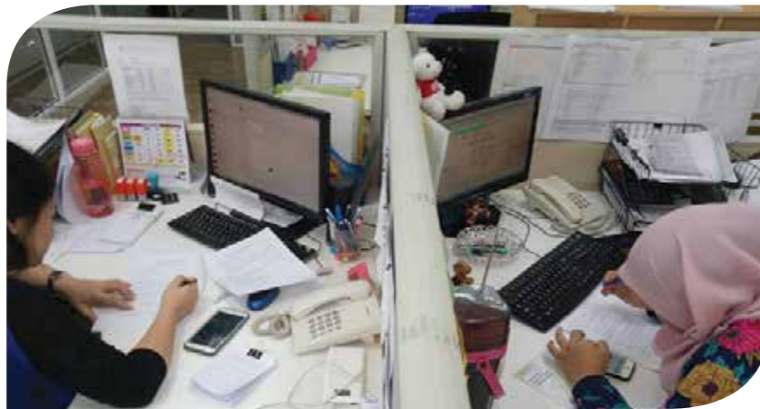
Employees taking ESH quiz.

ESH Quiz was carried out in March. 36 employees took part in the quiz and 78% passed. We will organise more refresh training to the employees to enhance the knowledge and understanding about the ESH.