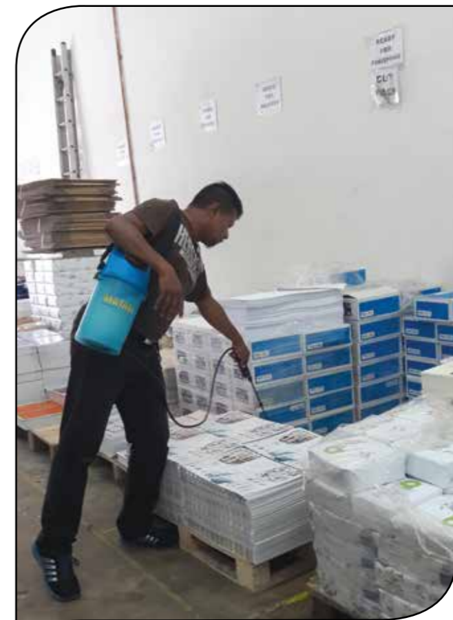
Newly implementation pest control process in periodic extermination of existing infestation and the prevention or limitation of re-infestation within practical limits.

Printed on FSC® certified 100% Recycled Paper