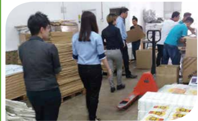
Baush & Lomb client visited our Storage Area.

Client from Baush & Lomb came for a plant visit and audit. The clients has a good overview of eco printing and eco products and provide us with some observations report. Following their request, we had run the pest control spray service on 20 March 2018 (Tue).