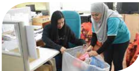
Colleagues of NI cleaning their workplace.

We organised a spring cleaning. This is a day to clear all waste, to rearrange the spaces, and paint the necessary area in order to have a better working environment for all.