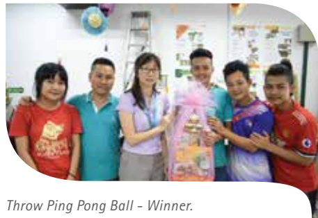
Throw Ping Pong Ball - Winner.