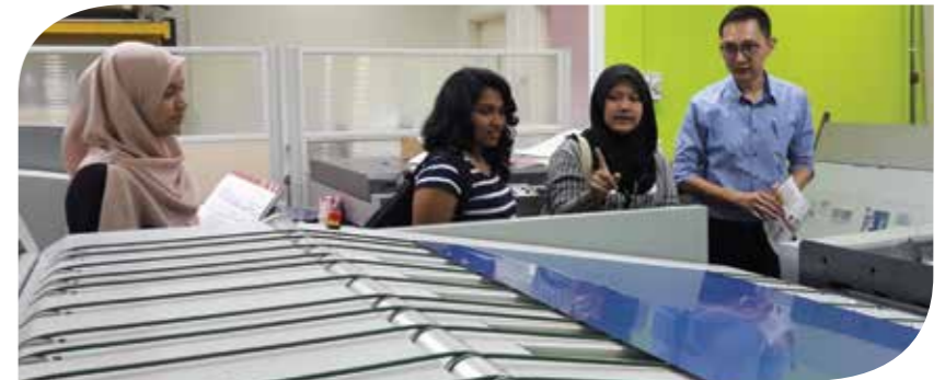
WWF client visited our Prepress Room.

Once again, representative from WWF came for a plant visit. The clients has a good overview of eco printing and eco products.