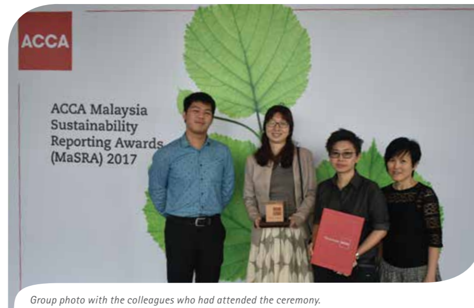
Group photo with the colleagues who had attended the ceremony.

Our organisation's Sustainability Report 2016 was one of the 20 shortlisted reports from the 59 participating organisation.