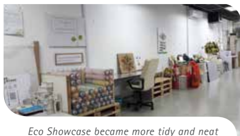
Eco Showcase became more tidy and neat as a result of joint efforts.