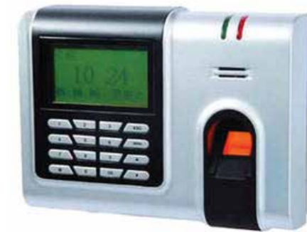
Newly installed Fingerprint Time Attendance System at QC/ Packing/ Workmanship Unit of Nets Impression.