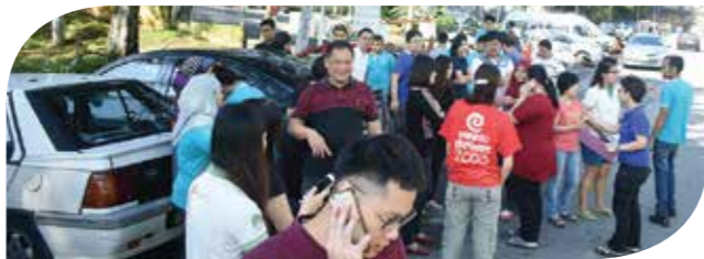
Colleagues managed to evacuate within three (3) minutes when hear the fire warning.

We organised annual Fire Drill to increase employee's awareness and responsiveness on fire and emergency.