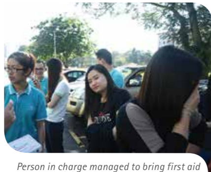
Person in charge managed to bring first aid kit to assembly point to rescue people.