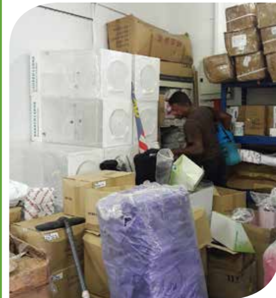
Skill Termite Exterminator Sdn Bhd personnel is doing pest control.

We have implemented pest control spray service at all the premises to prevent and control the entrance of pests' infestations in facilities plant and workplace.