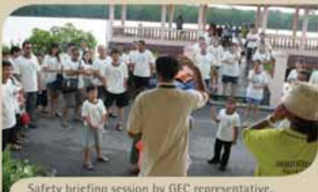
Safety briefing session by GEC representative.