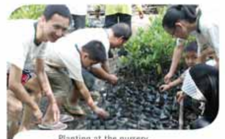
Planting at the nursery.