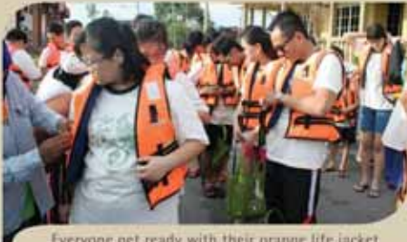
Everyone get ready with their orange life jacket