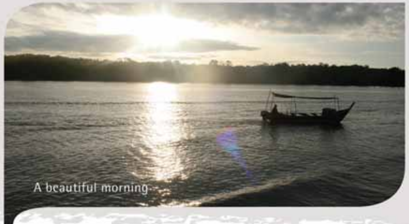
A beautiful morning

It had been a muddy but fun filled experience for the participants. Everyone enjoyed the boat ride, the beautiful scenery and dual planting (one at the mudflat area and one at the nursery).