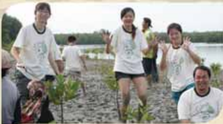
It's easier to seat down than trying to move a step further.