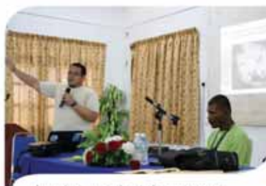
Learning more about the mangrove.

Participants were introduced to "Sahabat Hutan Bakau" (SHB) or Friends of Mangroves in recognition of the need for the involvement of the local communities in the mangrove rehabilitation programme. We were glad to find out that our event helped the local fishermen and GEC in training the local community to develop ecotourism as well as protecting the mangrove forest.