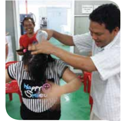
One colleague is sprinkling water for another New Year Blessing