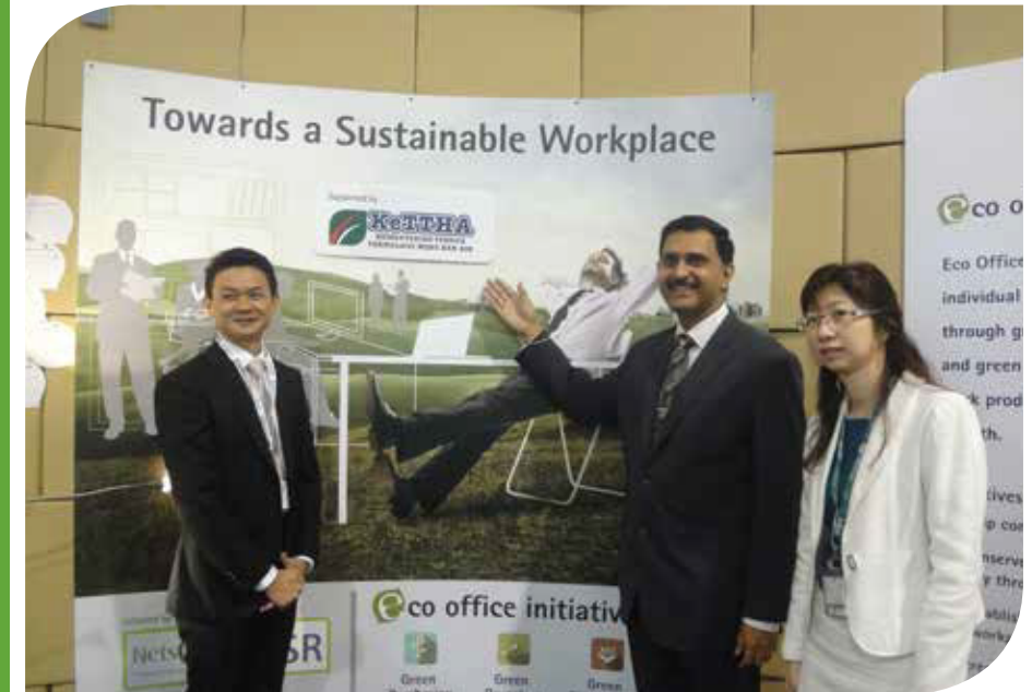
Eco Office Initiative Project supported by Ministry of Energy, Green Technology & Water (KetTHA)