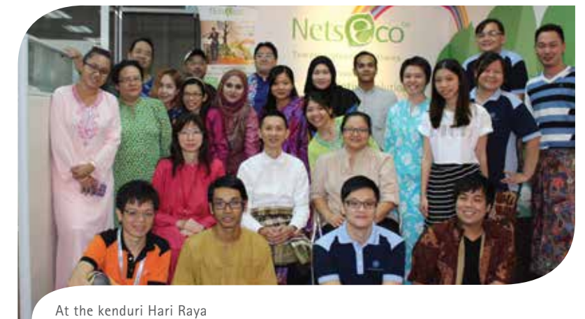
At the kenduri Hari Raya

We had a Malay traditional apparel competition. Employees were divided into groups and they had to dress up one employee with the given material within a given time frame. We hope this event could educate employee to have a better understanding about the local traditional culture.