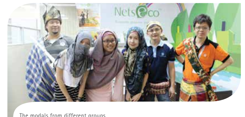
The modals from different groups

Most of the non-Muslim are lacking of knowledge on wearing the Malay traditional apparel so there are many innovative ways of wearing it. However, after the demonstration from a Malay Colleague, others also tried and able to wear it in the correct way. Everyone was having an enjoyable evening.