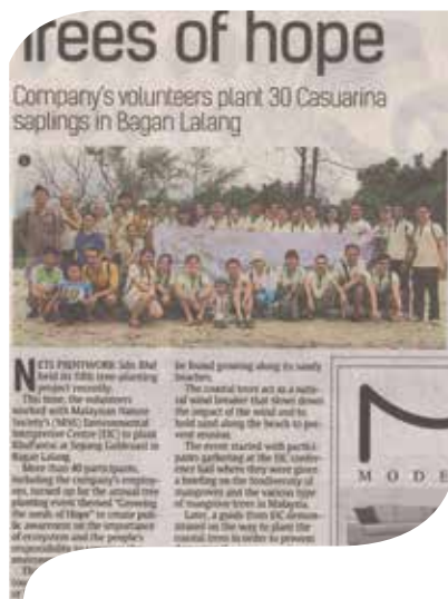
The event was reported at The Star newspaper

Our company continued the tree planting efforts for the fifth time on September 6 of this year. This time we worked with Environmental Interpretive Center (EIC) of Malaysia Natural Society (MNS) to plant Rhu Pantai at Sepang Goldcoast, Bagan Lalang.