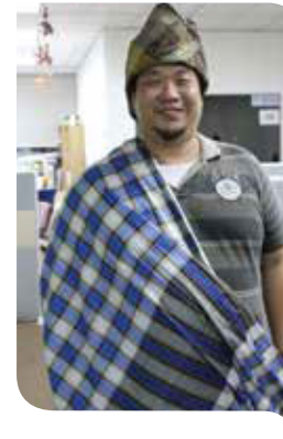
Costume Competition during Kenduri Hari Raya