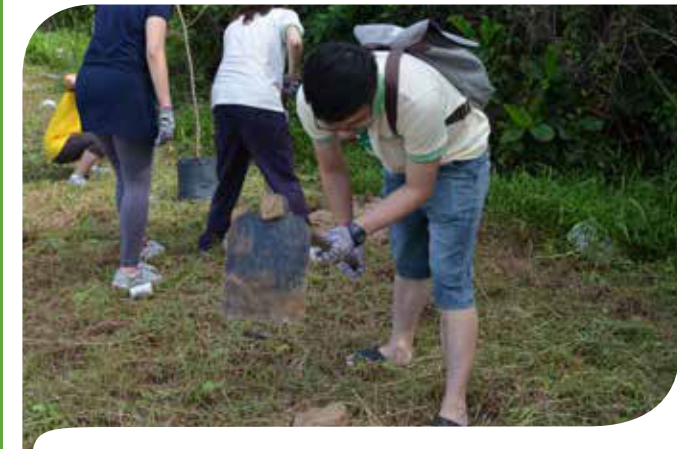
Tree Planting Activity 2014