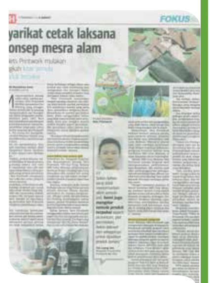
One page coverage on us at the SMEs section.