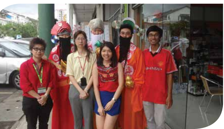
The Eco Welfare team having a group photo with the "Three Wise Man".

We had our Chinese New Year (CNY) Celebration on 4 Feb 2016 (Thursday) and the theme for this monkey year is ". This year we decided to have 'fuk luk shou'(福禄寿) Chinese Three Wise Man instead of the God of Fortune. We would like to thank the design team for making this possible. Another new initiative for this year is video shooting of the New Year blessing message of every department. The video clip was shown after the MD's speech. The game sessions were well received by the employees as we see a higher participation rate this time.