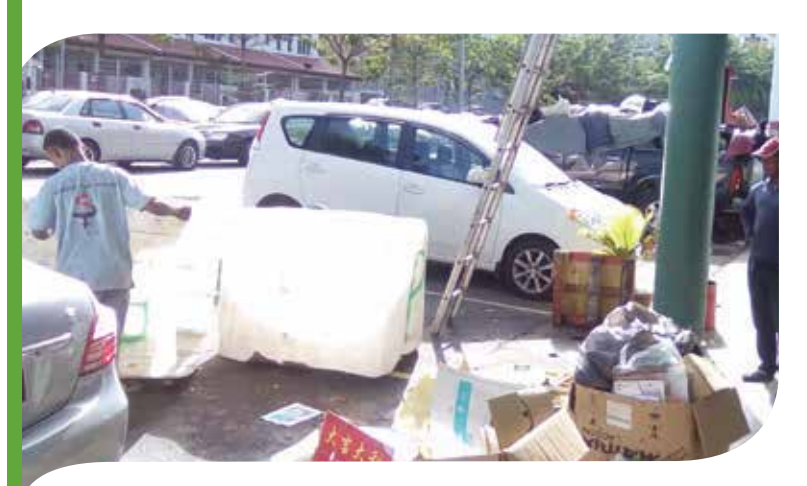
Some of the rubbishes gathered for further disposal