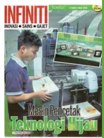
Our operator made to the front page and another two pages of details coverage.

Our interview report with Berita Harian was arranged by SMECorp and the news was published on 5 February 2016 (Friday).