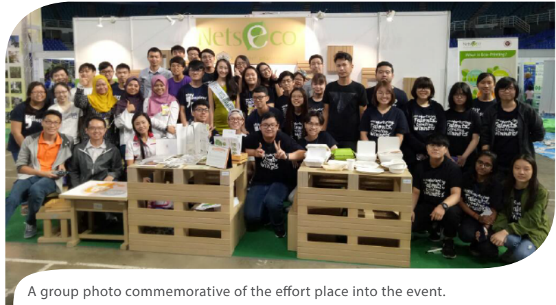
A group photo commemorative of the effort place into the event.

The Penang International Green Carnival has come back again this year, thanks to the Penang Green Council! They continue to aim to raise environmental awareness, and we are fortunate to continue contributing with them by participating at the venue of Setia SPICE (Subterranean Penang International Convention & Exhibition) Center, Penang. A team of five were sent to represent our company and introduced our eco products and services.