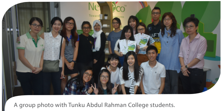
A group photo with Tunku Abdul Rahman College students.

The company has received a group visit of 13 students from Tunku Abdul Rahman (TAR) College, to which they are exposed to our eco designs as well as eco work ethics. These students are undergoing Mass Communication course, coming with the intention to understand the printing processes better for their course, Design for Print.