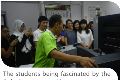
The students being fascinated by the Anicolor press machine.