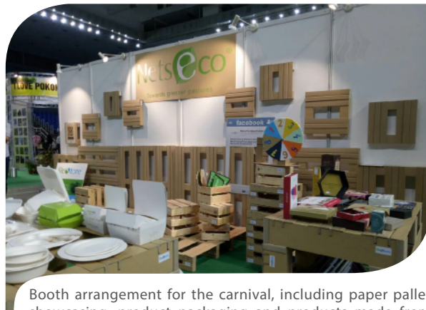
Booth arrangement for the carnival, including paper pallet showcasing, product packaging and products made from wooden pallet.

We have managed to win Best Booth Award as well during this event, which brings pride to us as a company.