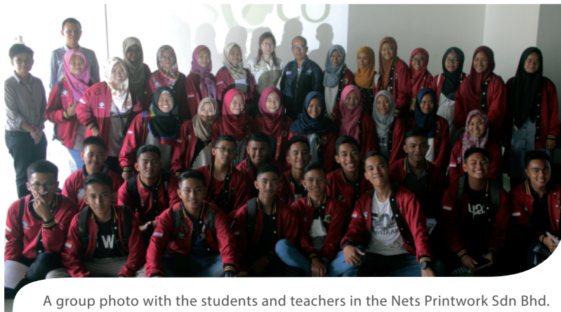
A group photo with the students and teachers in the Nets Printwork Sdn Bhd.

Another group of 37 students, this time from Sekolah Menengah Analisis Kimia (SMAK) has come for a company visit, all eager to learn our way of working in the eco-printing industry. These students are from the science stream, and are eager to learn the ways of saving the environment on an industrial level, with our company as a first example for them.