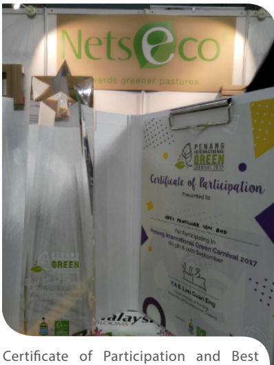
Certificate of Participation and Best Booth Award trophy obtained from the Penang International Green Carnival.

9 - 10 September 2017 (Saturday & Sunday)