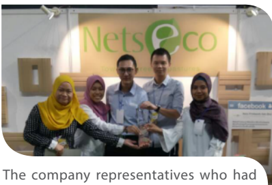
The company representatives who had traveled from Kuala Lumpur to Penang for the carnival.