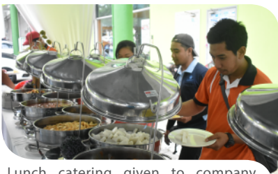
Lunch catering given to company employees to fit the festive mood.