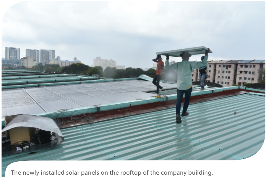
The newly installed solar panels on the rooftop of the company building.