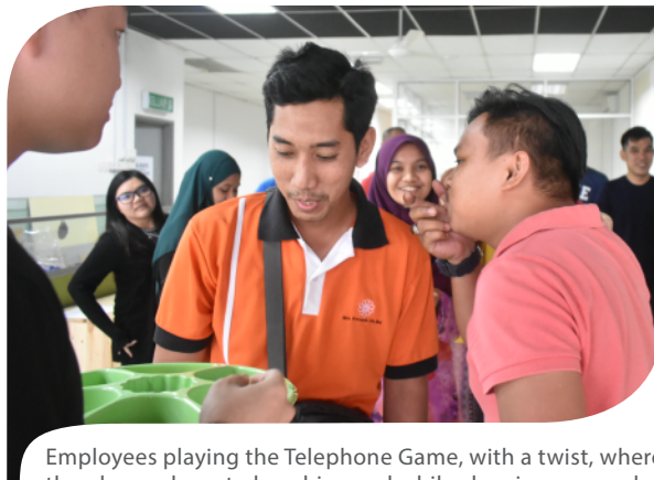
Employees playing the Telephone Game, with a twist, where the phrases have to be whispered while chewing on snacks.

Another year, another Hari Raya celebration, all thanks to the Eco Welfare Committee! Not only does this celebration introduce the wonders of the Malay culture, it also strengthens the relationship between employers and employees in the company. We had a celebratory lunch as well as fun playing the Telephone Game, where the team has to pass a message ear to ear, all while chewing on local snacks.