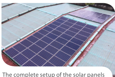
The complete setup of the solar panels above the company building.