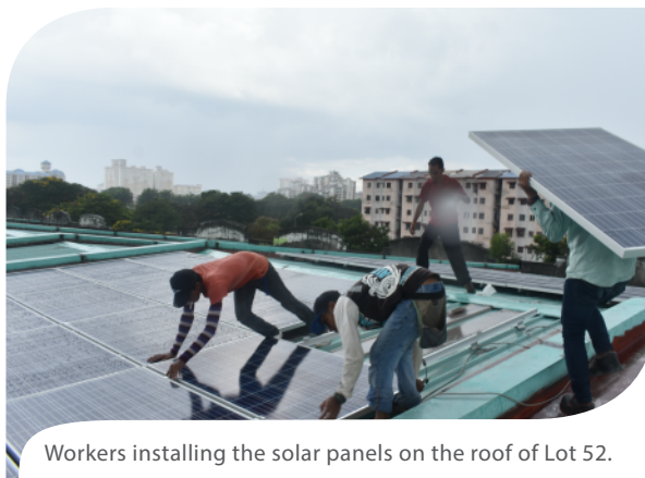
Workers installing the solar panels on the roof of Lot 52.

The installation of the solar panels are done in a single day, complete and ready to go on the top of Lot 52. The objective of installing the solar panels is to further build an eco-friendly environment for the workplace. This set of solar panels can generate as many as 18 kiloWatts of electricity, and is set up under the FiT (Feed-in Tariff) Program, which enables the company to sell renewable energy at the FiT rate.