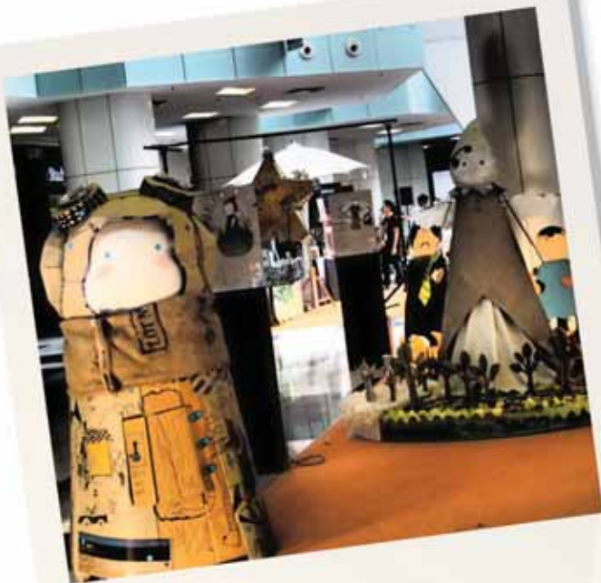
Celebrate Earth Day