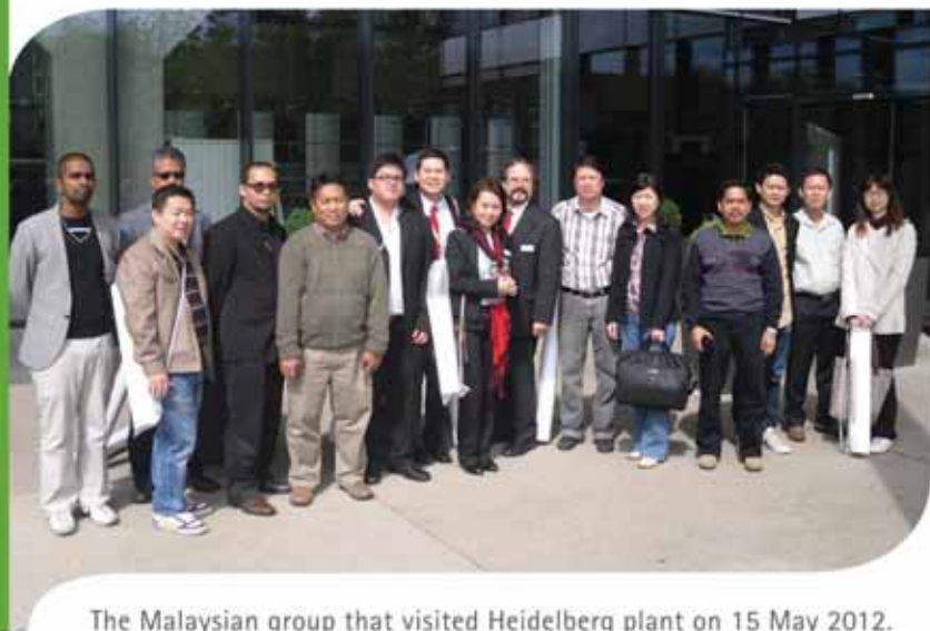
The Malaysian group that visited Heidelberg plant on 15 May 2012.