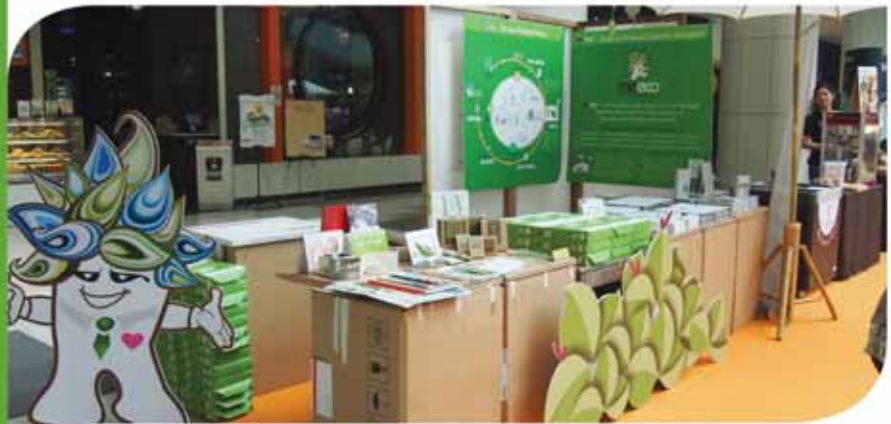
Our exhibition booth at Just Life Earth Day Carnival.

We participated in the Earth Day Carnival held on 19-22 April 2012 at the 1 Mont Kiara Mall, organized by Just Life. The theme for this year was "New Earth" which focuses on the next green generation. We were ever too happy to introduce the Meeco stationary "cradle to cradle" series during the 4-day event.