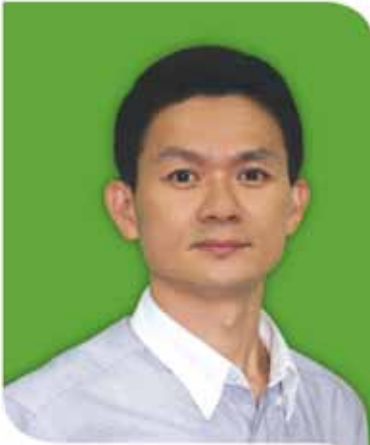
Our Corporate Sustainability Director Speaks