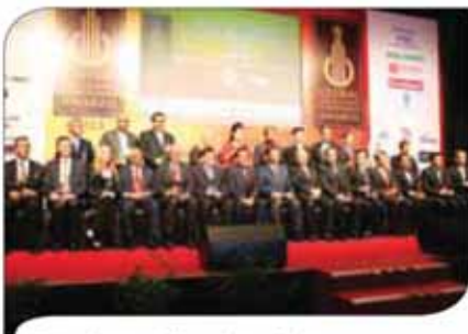
Group photo of all awards recipients

We just won the GLOBAL EXCELLENCE in MANAGEMENT AWARDS 2013 (GEMA 2013) – EXCELLENCE IN ECO INNOVATION MANAGEMENT AWARD. GEMA 2013 is organized by the Institute of Management (MIM) and is duly supported by various related organizations around the globe namely the American Leadership Development Association (ALDA) and the Federation of GCG Chambers of Commerce (FGCCC ).