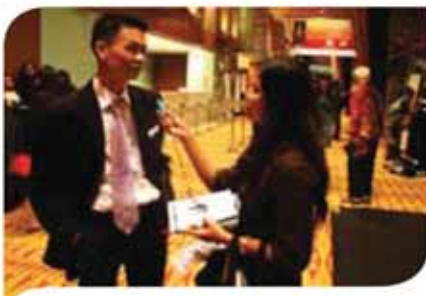
Interviewed by Management Magazine's reporter.