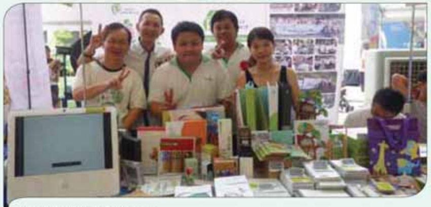
Group photo with our booth display

We were invited to participate in the BMS Adopt A Tree Event on 8-9 June 2013 (Sat and Sun) held at Setia Walk, Puchong Selangor. The event was organized by BMS Organic.