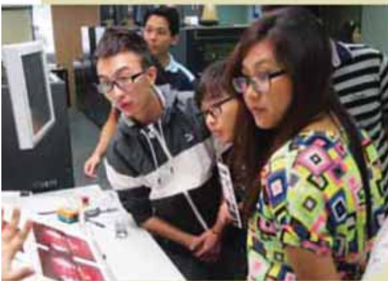
Students discovering the printing process at production area

We have successfully entered the second stage of assessment in the Prime Minister's Hibiscus Award 2012 / 2013! Two assessors and a representative from the PMHA organising committee visited our site on 28 June 2013.