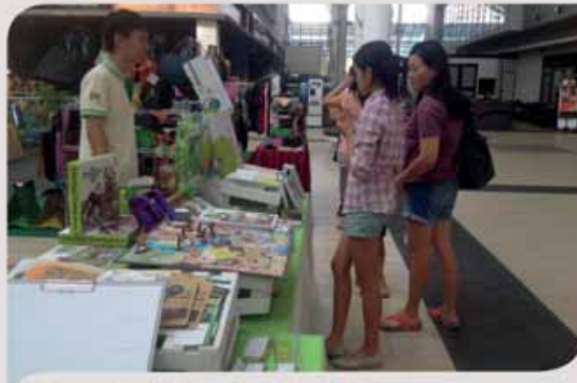
Some visitors taking interest of our products

We had participated at the Eco Lifestyle Fair organised by Green Lifestyle Associate and Bamboo Malaysia at Sunway Giza from 27-29 September 2013. This is the first Eco Lifestyle Fair and we received good response from the visitors.