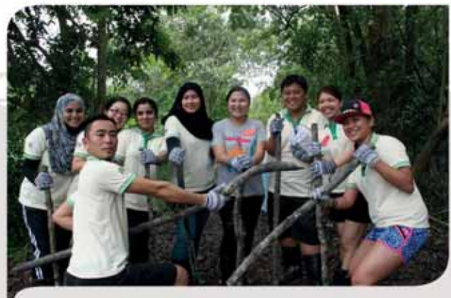
Having fun during tree planting session

After the tree planting activities, our employees were having team building activities right after that at the same places. The team building activities aim to gather all employees, build trust and enhance relationship with each others.