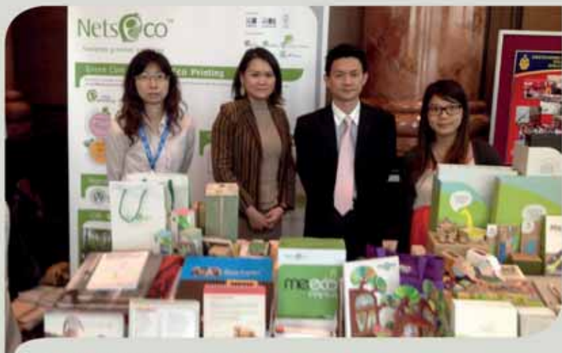
Sustainability Department Group photo.

Nets Printwork Sdn Bhd had been invited to participate the 4th International Conference on Green Purchasing organized by Green Purchasing Network Malaysia (GPNM) Conference at Sunway Resort from 18-20 September 2013. The three day conference brought together world renowned experts and practitioners with more than a decade of green purchasing and green productivity experiences to share the successful implementation of green purchasing and green productivity. We also set up one promotional booth at the Green Purchasing Expo to introduce eco printing and eco products.