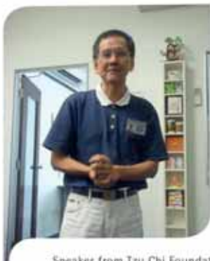
Speaker from Tzu Chi Foundation

To further enhance the knowledge of 3Rs stated in our Environment Policy, we had organized one recycling talk for the employees. Seven members from Tzu Chi Foundation share how to practice recycling at home and office on 16 November 2013 (Saturday).