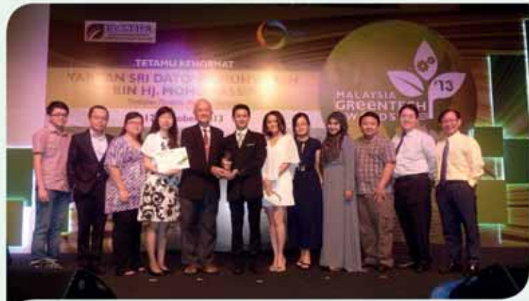
Group photos of Nets Group