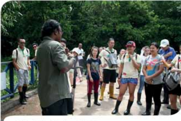
Our facilitator doing the safety briefing

This year, our annual tree planting event took place at Kuala Selangor Nature Park. We have total 35 participants (employees, suppliers and clients) to join us on this meaningful event. The species we planted for this year is Rhizophora mucronata . Rhizophora is a genus of tropical mangrove trees, it live in intertidal zone of which are inbouded zone near to the ocean. The seedlings are viviparous. The leaves are opposite and oblong shape and have tiny black spots on the underside. The tree can grows up 30m tall and has curved stilt roots.