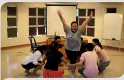
Part of the team building activities

After the tree planting activities, our employees were having team building activities right after that at the same places. The team building activities aim to gather all employees, build trust and enhance relationship with each others.