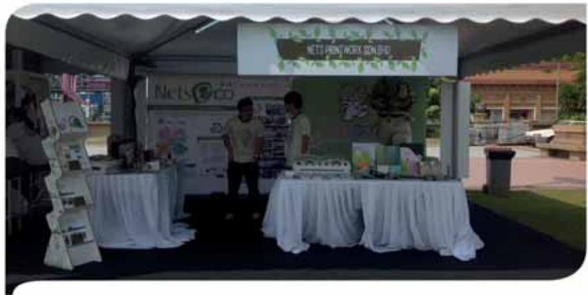
Our booth layout

Following the Penang roadshow, we joined Honda Hybrid Eco Roadshow for the second time at Dataran Pahlawan, Malacca from 24-25 August 2013.