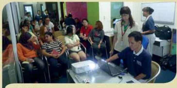
Before the talk

To further enhance the knowledge of 3Rs stated in our Environment Policy, we had organized one recycling talk for the employees. Seven members from Tzu Chi Foundation share how to practice recycling at home and office on 16 November 2013 (Saturday).