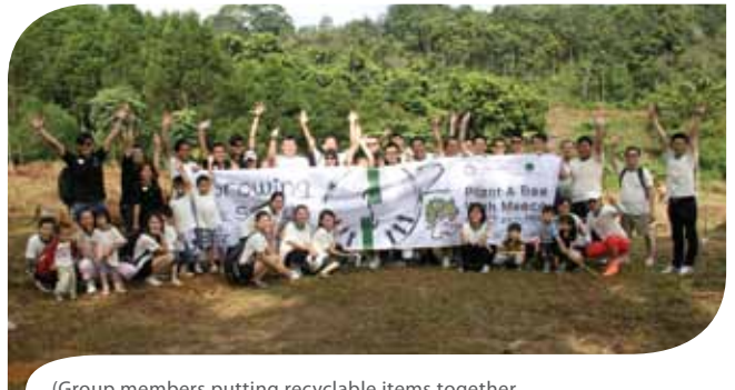
(Group members putting recyclable items together. They turned out to be the winner of the Best Eco Creative Awards!)