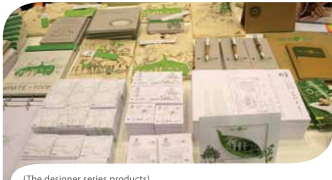
(The designer series products)