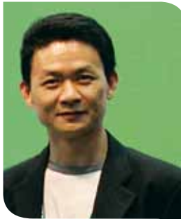
Our Corporate Sustainability Director Speaks