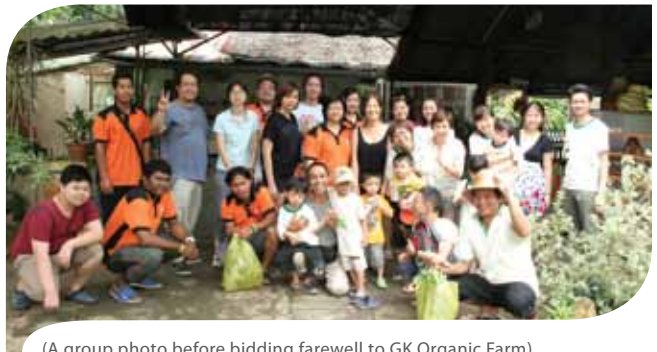
(A group photo before bidding farewell to GK Organic Farm)