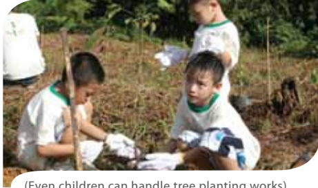
(Even children can handle tree planting works)