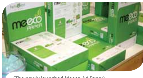
(The newly launched Meeco A4 Paper)