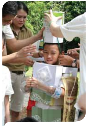
(Participants having a good time in a group photo session)