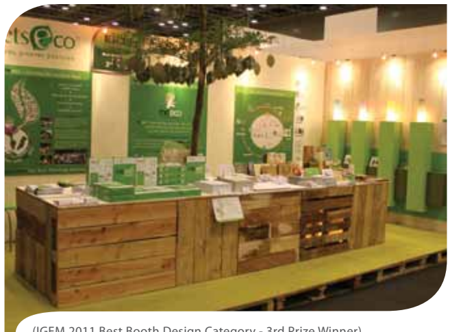
(IGEM 2011 Best Booth Design Category - 3rd Prize Winner)