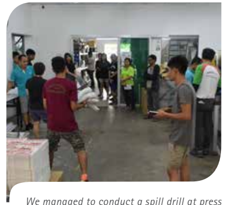
We managed to conduct a spill drill at press room area.