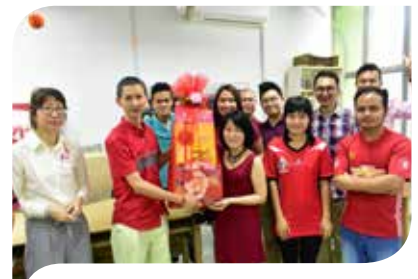
Winner of the 'Red and Green Bean' and 'Orange by Spoon'.