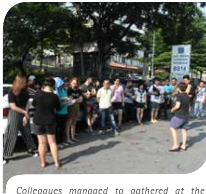
Colleagues managed to gathered at the assembly point after hearing the fire warning.

We have organised annual Fire Drill & Spill Drill on 30 March 2019 (Saturday) to increase employee's awareness and responsiveness on fire and emergency.