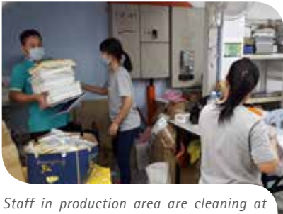
Staff in production area are cleaning at their working space.