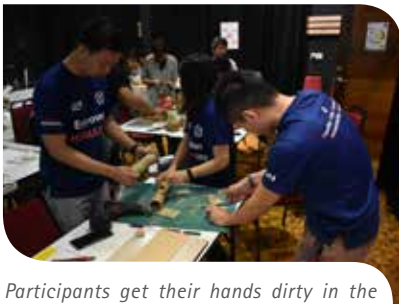
Participants get their hands dirty in the workshop

This workshop was attended by 26 participants and have achieved the objectives to expose the participants to upcycling design, to differentiate the value of the waste, to market their innovation and turn it into profitable business.