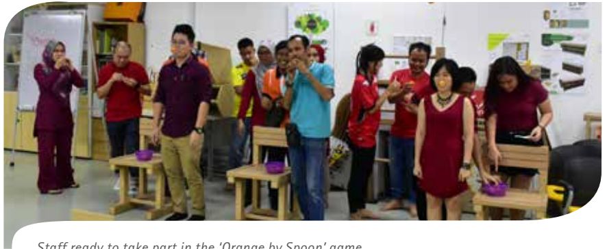
Staff ready to take part in the 'Orange by Spoon' game.