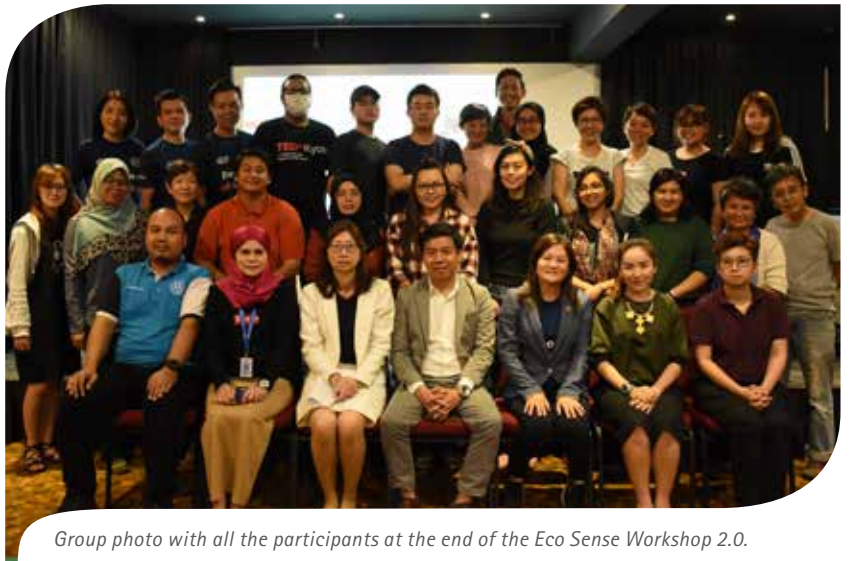
Group photo with all the participants at the end of the Eco Sense Workshop 2.0.