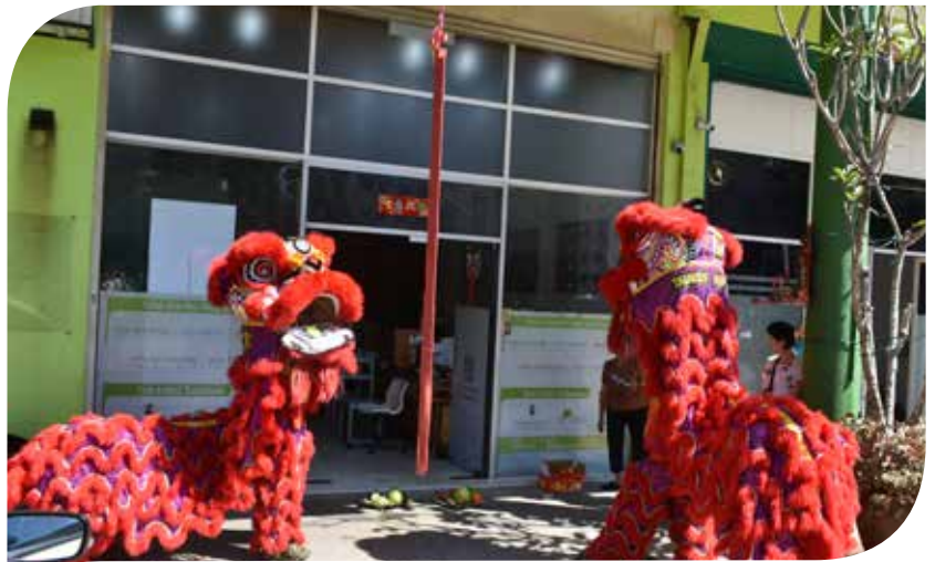
Lion dance in front of Nets Group's reception area.

Lion dance performance took place on 11 February 2019 (Monday) in first day of working day after CNY in front of office to bring good luck and fortune.