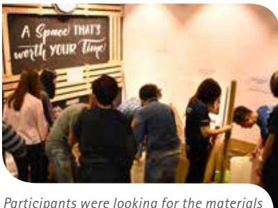
Participants were looking for the materials from the unwanted items corner to be used in their new product design.