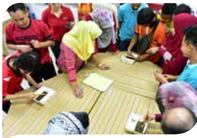
During 'Red and Green Bean' game.