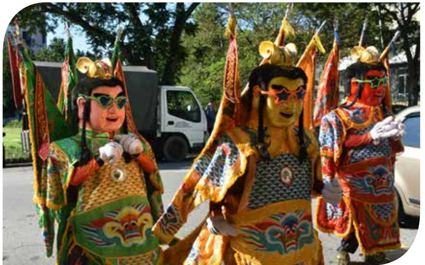
Electric-Techno Neon Gods in front of Nets Group's reception area.