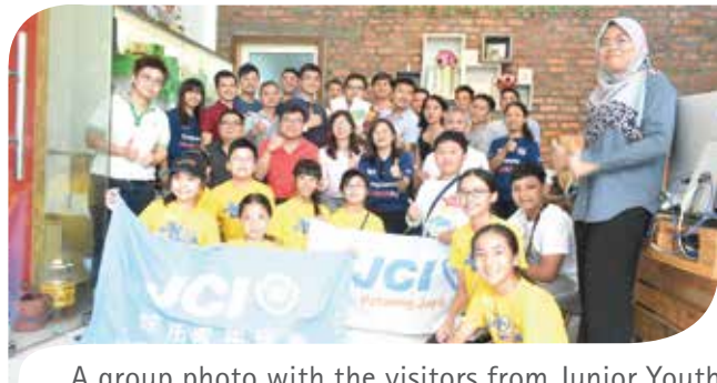
A group photo with the visitors from Junior Youth Chamber (JCI) Petaling Jaya and JCI Hong Kong for their Junior Ambassador Program.