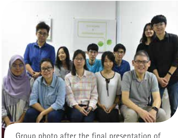
Group photo after the final presentation of Taiwan intern students.

After 2 to 6 months doing an internship at Nets Printwork, all works of the students were evaluated at their final presentation on 29 July 2019 (Monday) and 22 August 2019 (Thursday). Final presentation is one of the criteria in Eco Sense Structured Internship Programme (SIP) that need to be completed by all the intern students in Eco Design and Innovation Centre.