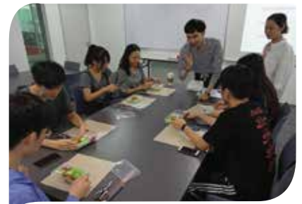
Students are doing the hands-on activity to produce green packaging by using the local raw materials at INTI Subang.