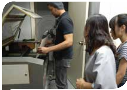
Lab assistant demonstrate on how to use the laser cutting machine.

We have conducted an event called as '1 Day Experience at INTI @ ICAD' to INTI Subang on 8 August 2019 (Thursday). The purpose of the visit is to expose the students to various machine and facilities that are provided by INTI Subang.