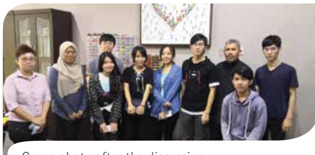
Group photo after the discussion.