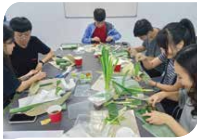
Lecturer explained the different type of Malaysian Kuih, which need a different green packaging.