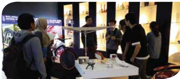
The students were brought to take a look at exhibition area in MRM.