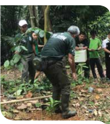
The guide showing the participants on the correct method to plant a tree.