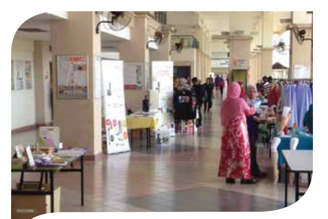
The exhibition area at Department of Chemical & Environmental Engineering.

Department of Chemical & Environmental Engineering, UPM celebrated their 20th Anniversary 1996-2016 in UPM from 26 - 30 September 2016. Besides sponsoring the printed material, we were also showcasing our products at their exhibition area.