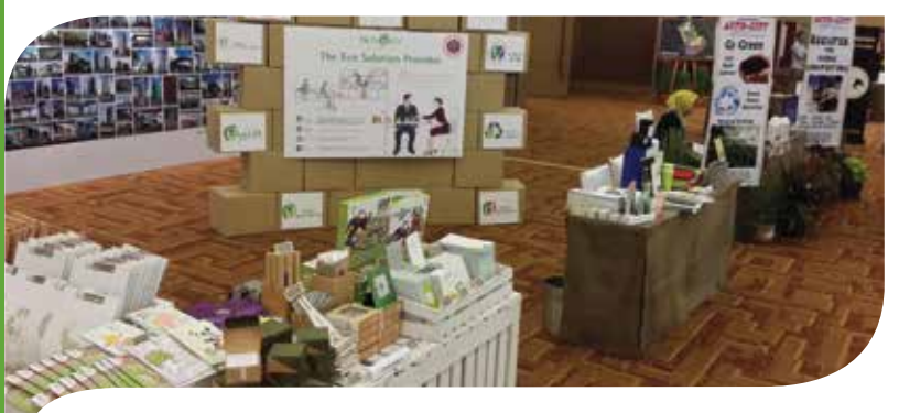
Our promotional booth area.