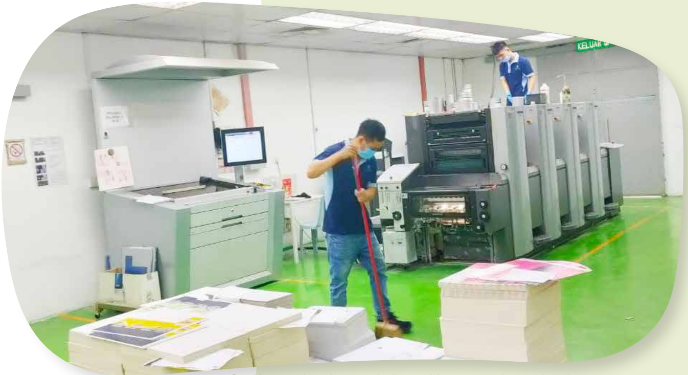
Staffs are cleaning at their working space in production area

We organised a spring cleaning on 17-18 January 2022 (Monday-Tuesday). This is the day to clear all waste and to rearrange the working spaces, in order to have a better working environment for all. We also introduce e-cleaning this year to clear and make our digital storage more organise.