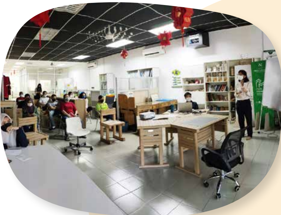
Ms. Teh conducting ESH training