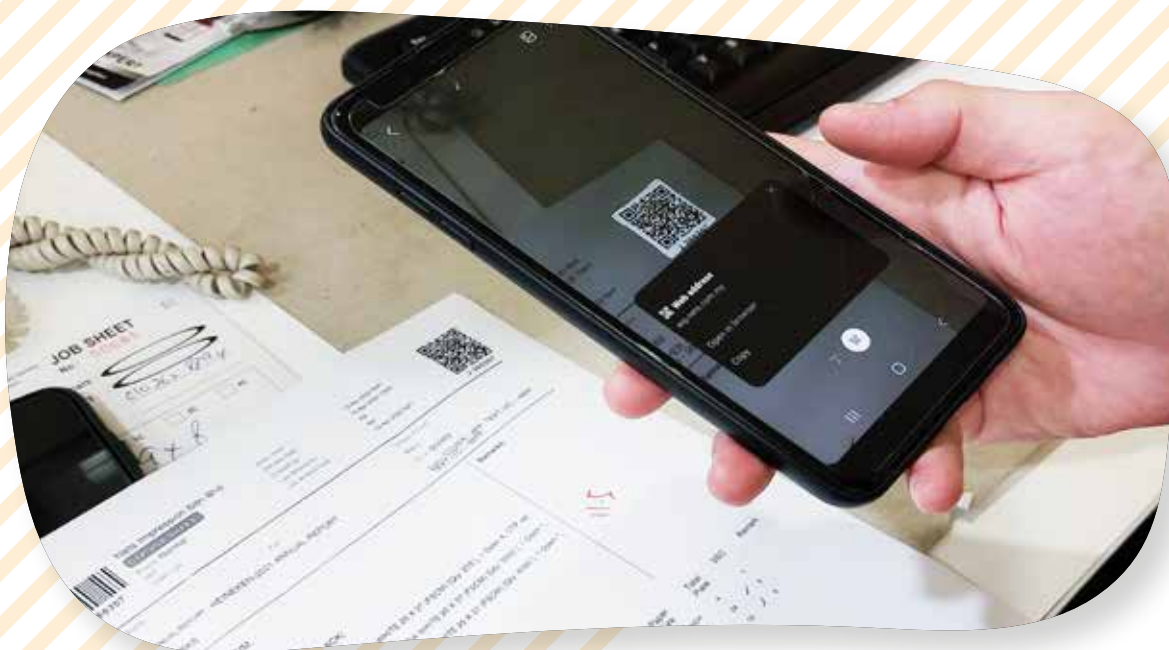
Staff scan QR of job sheet