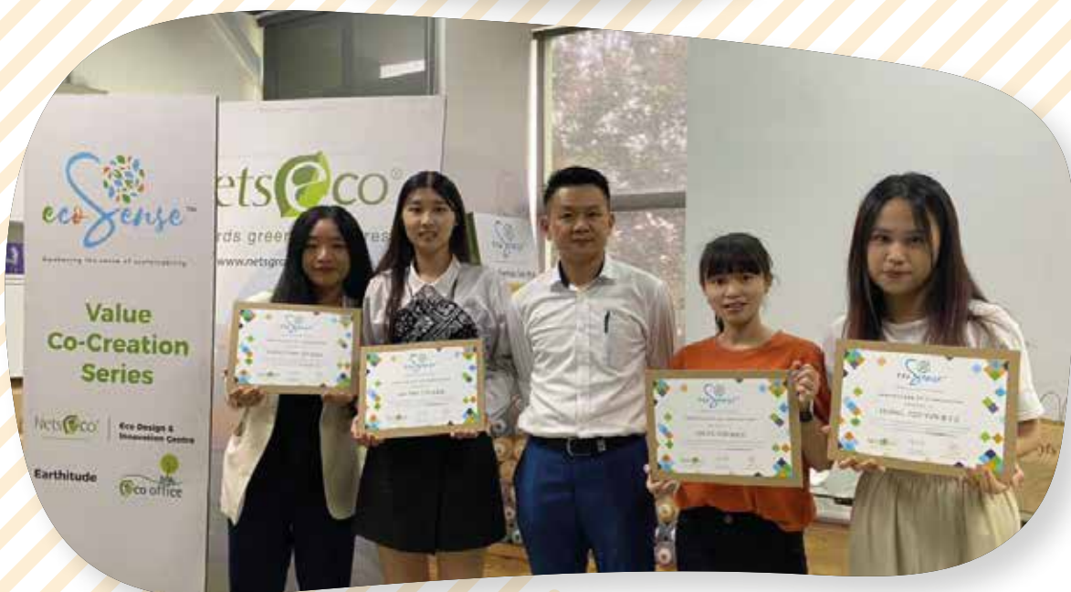
Mr. Teh (MD) presenting the certificate of completion to Taiwan intern students after their final presentation