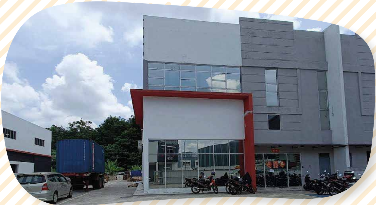
Front view of Nets Ecohauz Sdn Bhd plant

Upcoming GDPMD Certified Health Supply Chain Hub for Nets Ecohauz Sdn. Bhd. located at Com Industrial Park, Kawasan Perindustrian Kampung Baru Balakong, Seri Kembangan.