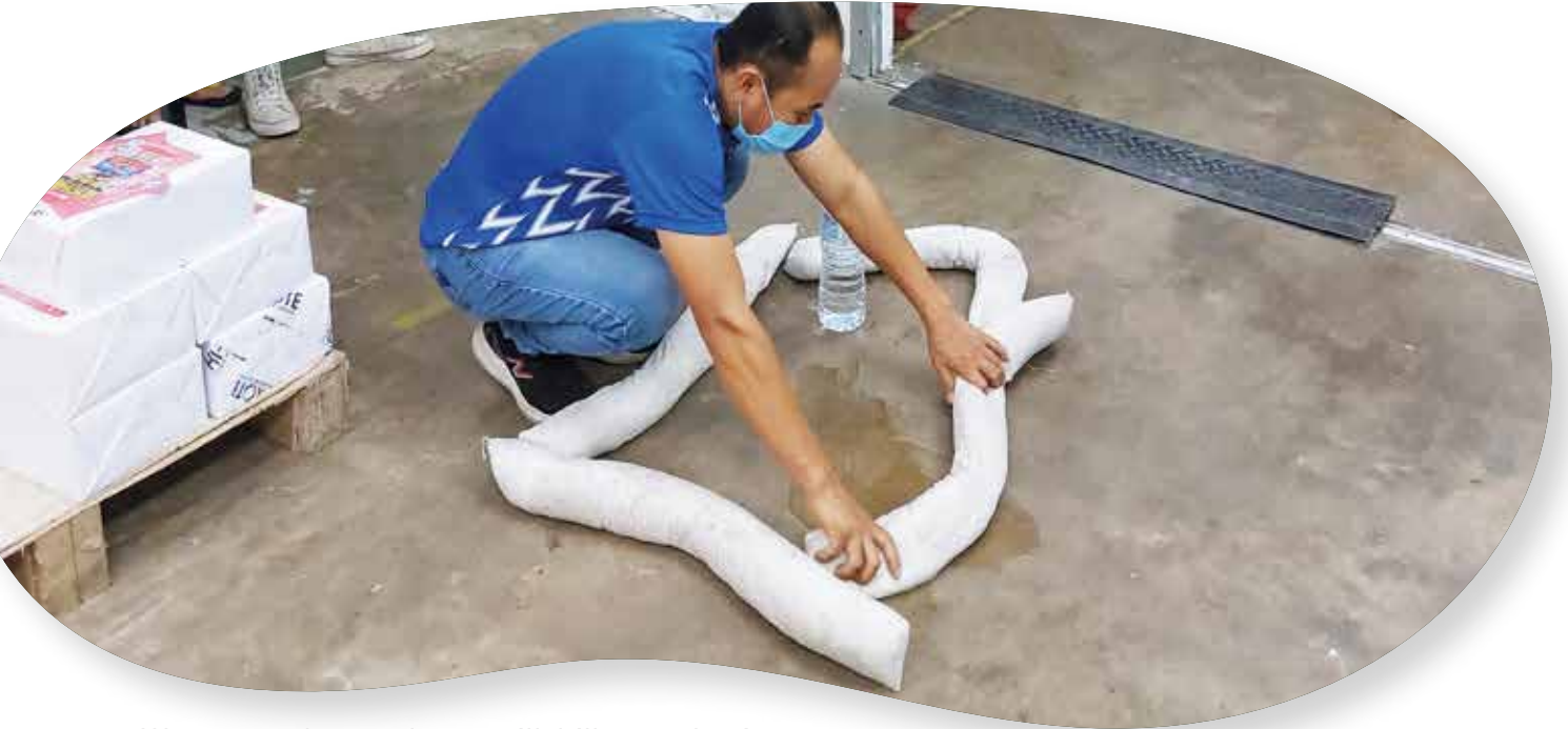
We managed to conduct a spill drill at production area

The annual Spill Drill was conducted at the production site on 30 April 2022 (Saturday) to train the responsiveness of our operator in case of a spill.