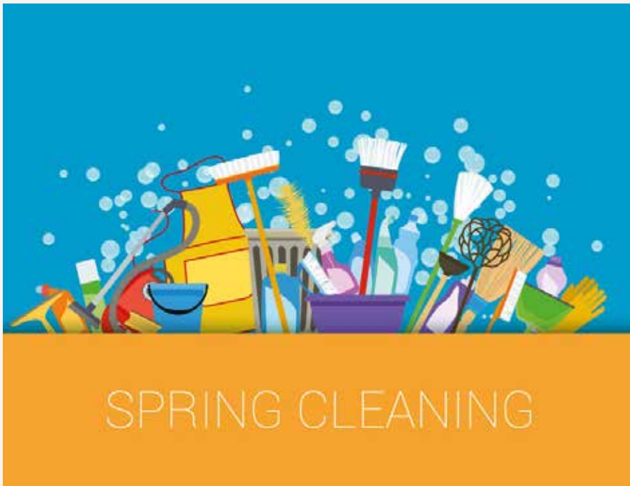
Spring Cleaning (5-6 January 2023)