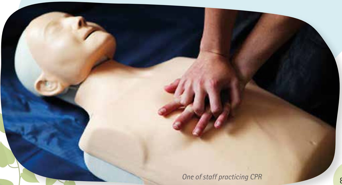
One of staff practicing CPR