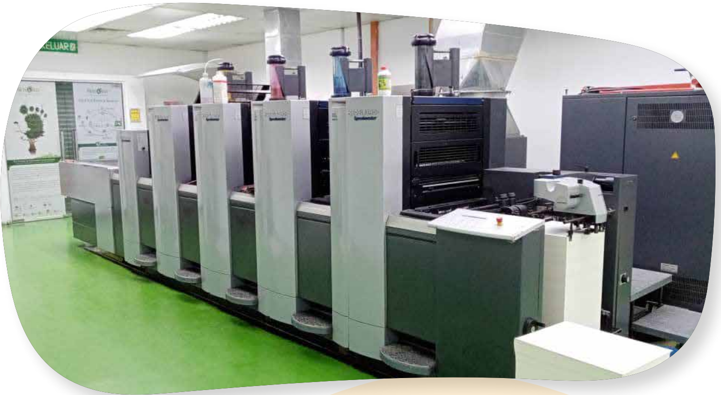
New replaced printing machine

We have a replacement of old Anicolor Machine to Heidelberg model SX52-4 to produce cost and time efficient printing products according to our client's demand. It is also a carbon neutral machine with a carbon neutral certificate.