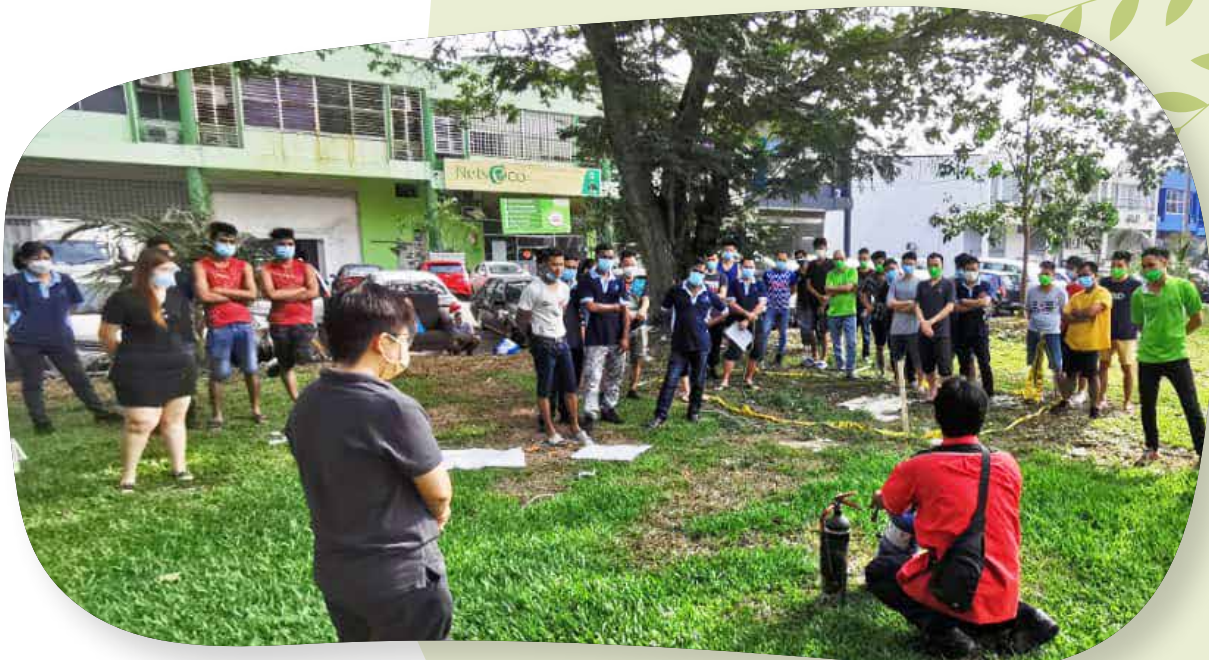
Mr. Zun from BLK Fire Control demonstrating on how to use fire extinguisher