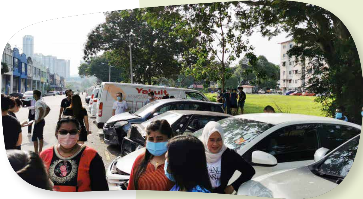
Staff managed to gather at the assembly point after hearing the fire warning

We have organised an annual Fire Drill and Demo of Fire Extinguisher on 30 April 2022 (Saturday) to increase employee's awareness and responsiveness on fire and emergency.