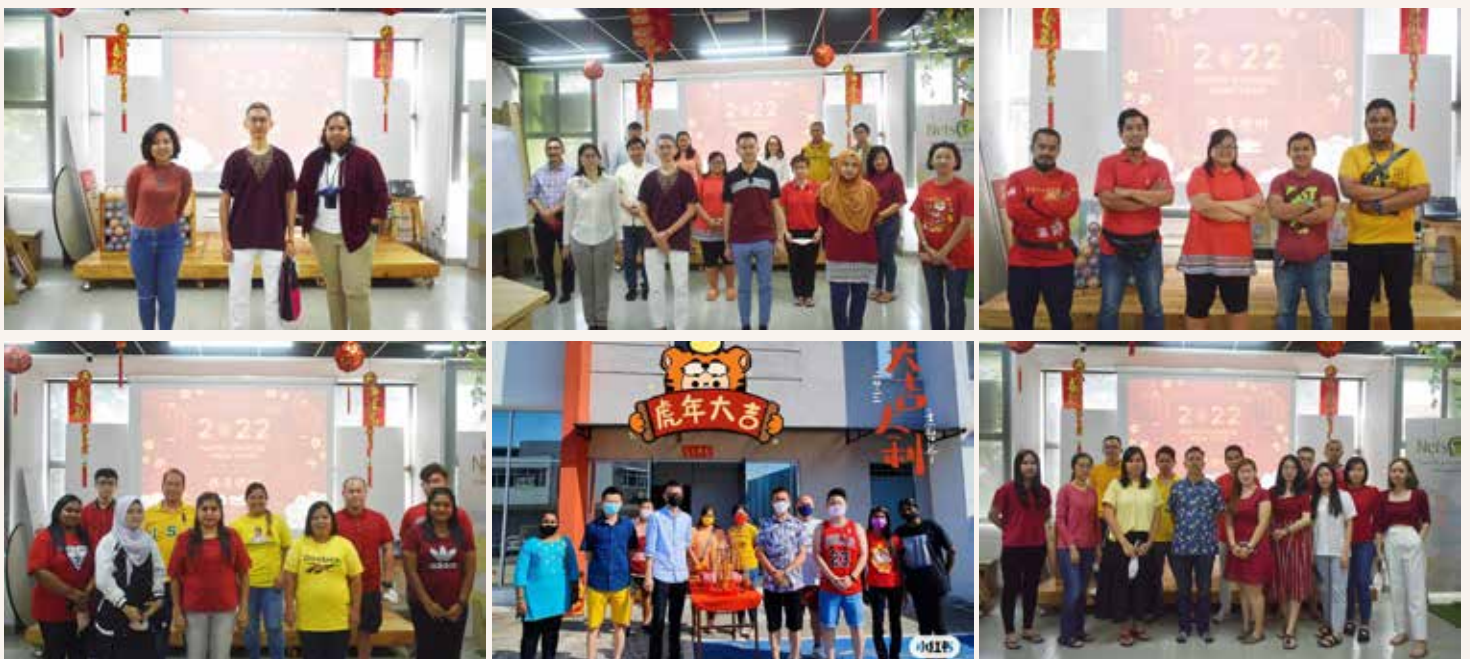
Group photo by companies with employees of Nets Group