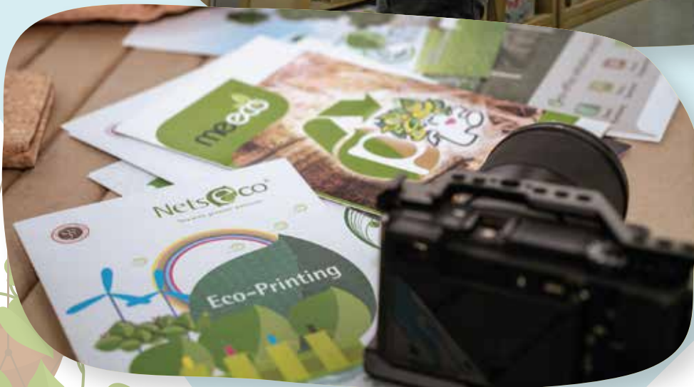
The video crew shoot video and take photo in the office and production