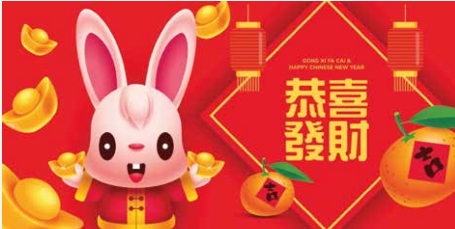
Chinese New Year Celebration (19 January 2023)