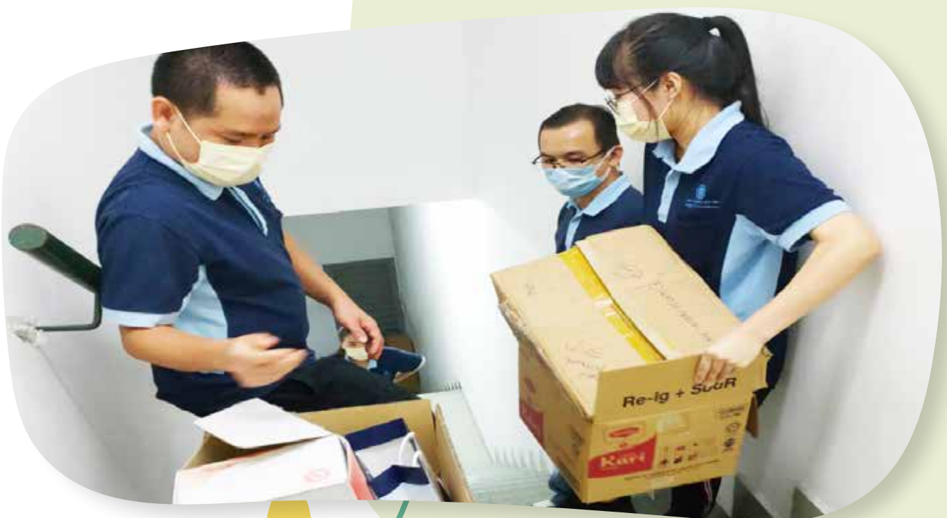
Helping each other to throw rubbish to recycle bin for office personnel