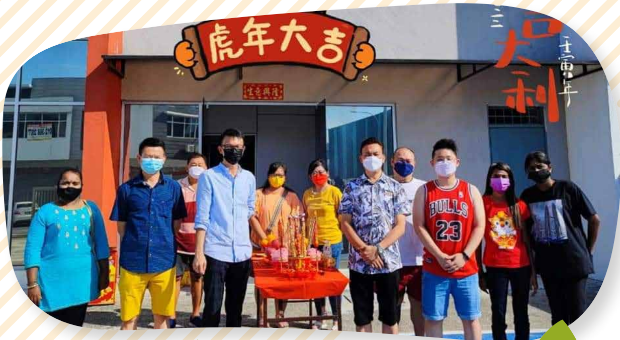
Group photo of Directors with employees