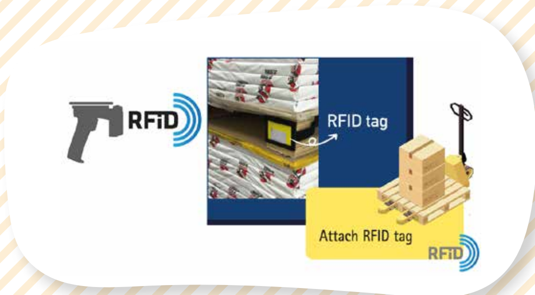
RFID tag and scan