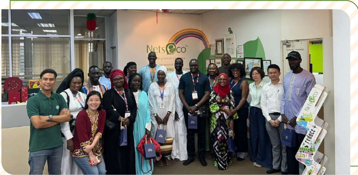
ADEMPE Senegal delegation took photo after visited the factory.

We welcome delegation from The Agency for the Development and Supervision of Small and Medium Enterprises (ADEPME) Senegal, which facilitated by SME Corp. Malaysia. We exchanged ideas on sustainability, innovation and SME growth, building stronger bridge between Malaysia and Senegal.