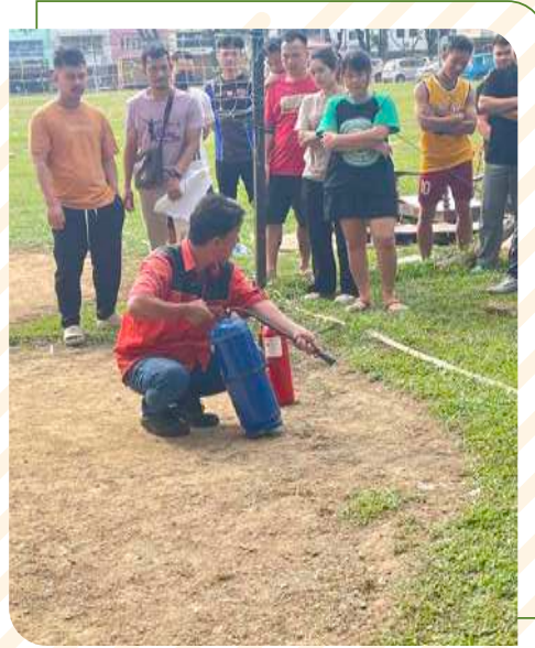
Our service provider representative demonstrated the use of fire extinguisher.