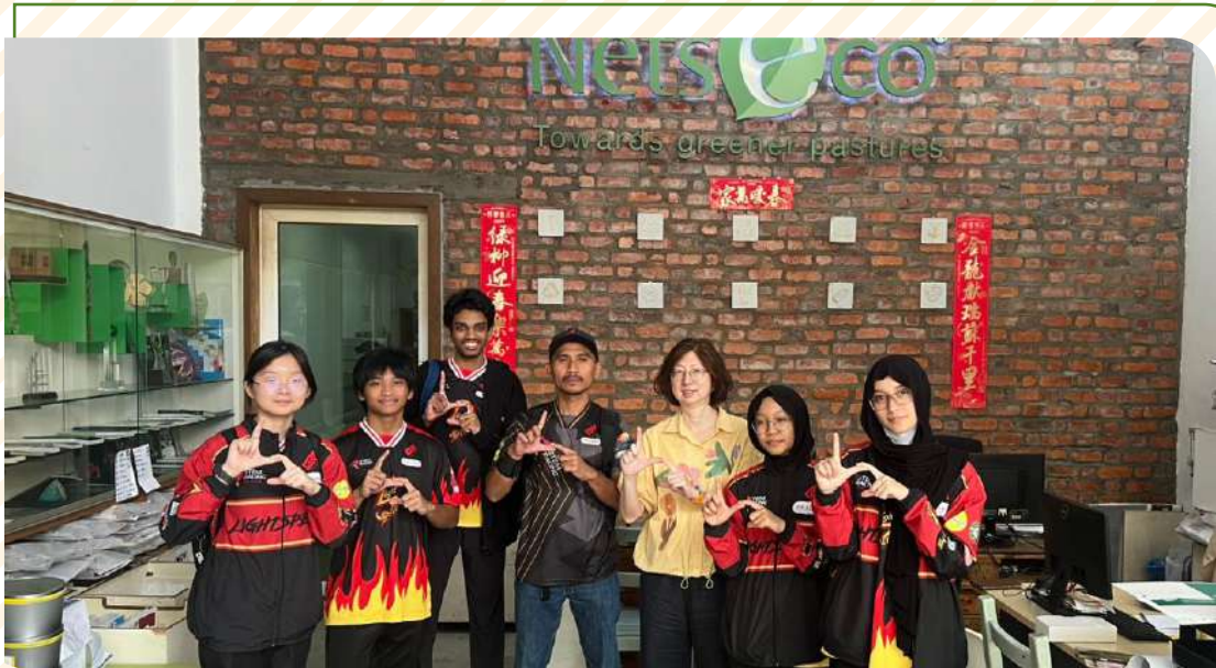
Group photo is taken at the end of plant tour.

A team of 5 students and a teacher visited our company on 9 December 2025 (Tuesday) with the aim to gain learning experience in aspects of sustainability. The students hope to draw inspiration from our company's efforts in sustainability, and in turn be encouraged to apply sustainability concepts to their competition entries.