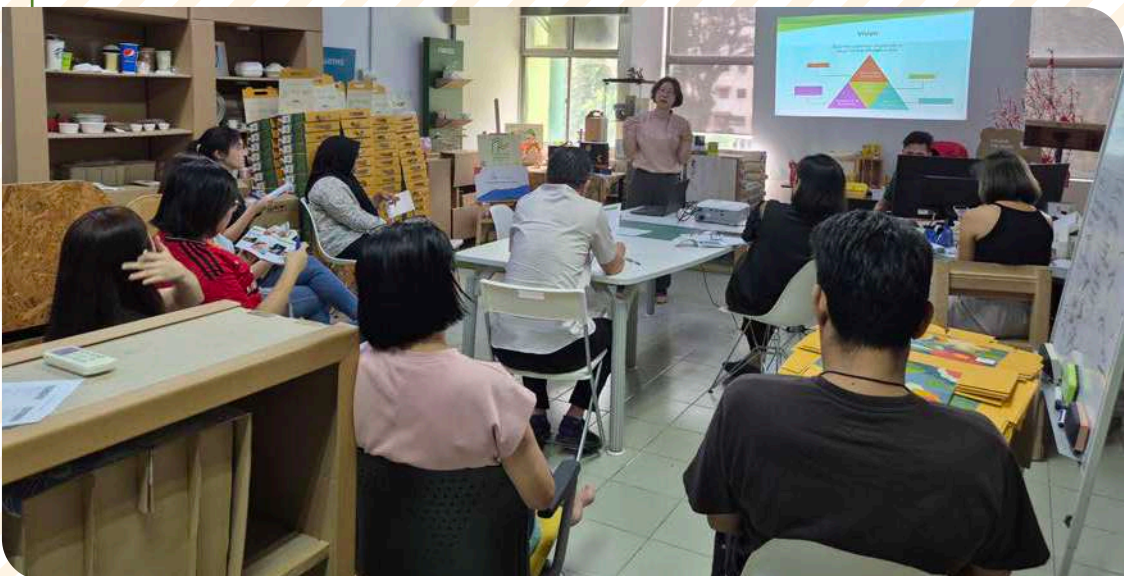
Ms Teh presented ESH training to employees attended