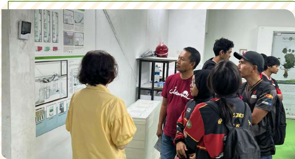
Explanation of Green Factory concept to the teams.