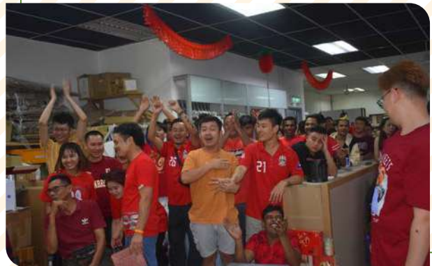
Employees were happy with the lucky draw session.