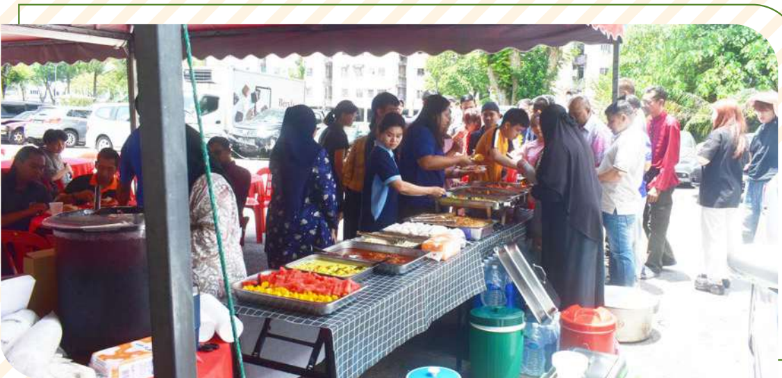
All staff enjoyed lunch buffet together.