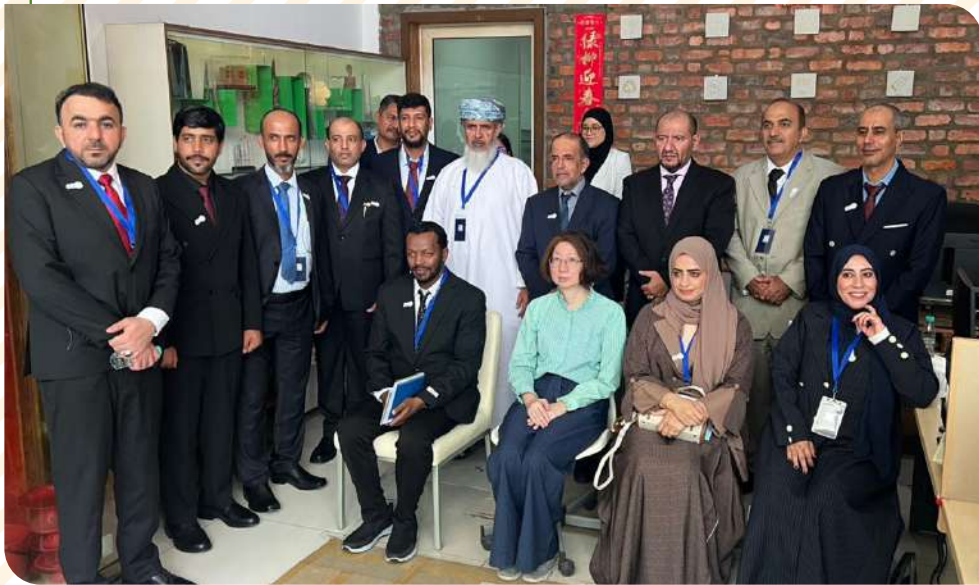
15 members of Oman Chamber of Commerce & Industry took photo in front of Nets office.

Through the introduction and recommendation of SME Corp. Malaysia, our company had the honour of hosting a visit from OCCI delegation. The delegation comprised representatives from diverse business sectors, including construction, manufacturing, and training and consultancy. We are privileged to have been selected to present our experience in sustainability and eco-innovation to OCCI. This visit provided a valuable platform to link Malaysia and Oman which may have collaboration in future.