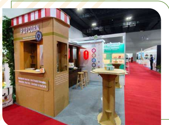
Overview of exhibition booth at MIHAS 2025