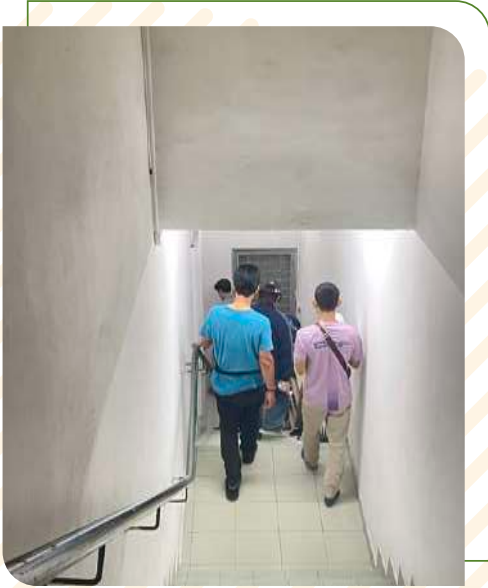
Employees were evacuated from each building by follow the evacuation route.

We organised fire drill and demo of fire extinguisher every year and all employees' practiced evacuation in the event of fire or emergency.