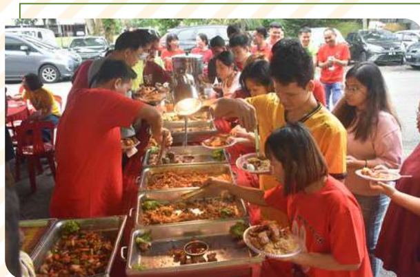
Employees enjoyed a variety of tasty dishes provided at the lunch buffet.