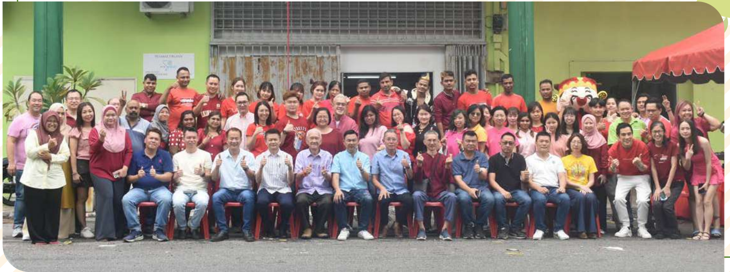
All members gathered together for a group photo.

We organised a festive event to spread joy among all employees to celebrate the approaching Chinese New Year. Besides that, the company presented Long Service Awards to employees in appreciation of their dedication and contributions.