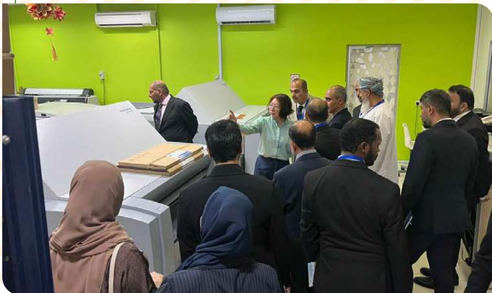
The team had a plant tour to understand production process.